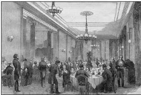
Banquet at The Lord Warden Hotel