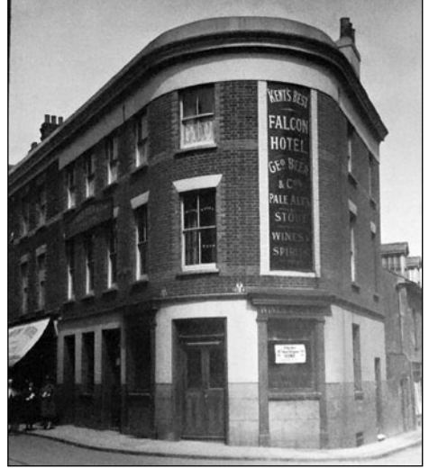
The Falcon Hotel