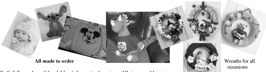
All made to order

Something Different - Unique and Unusual Framed Hand-Crafted Diamond Pictures by Denise