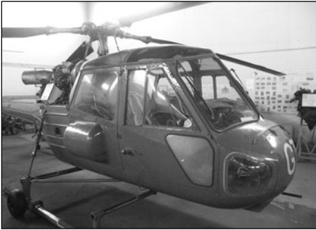
Westland Scout, South Africa Museum

At this stage another hazard showed itself, the presence of large discharges of static electricity whenever the skids touched the roofs. However, they pressed on, and the refugees were bundled aboard the Scout and down to the welfare centre established on high ground. Loading requirements were forgotten. On one flight, the tiny cabin was