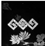
A selection of items for sale