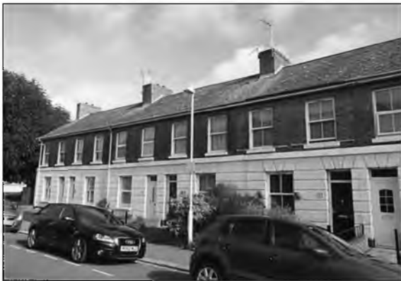
Dour Street 2019

4. Any recommendations that will protect and enhance the conservation area. Any changes proposed must sustain and enhance the historic environment and its heritage.