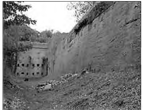
Moat at Fort Burgoyne