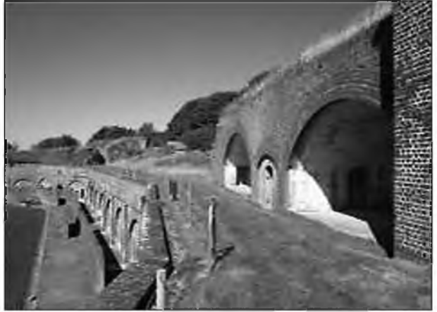
Casements Fort Burgoyne