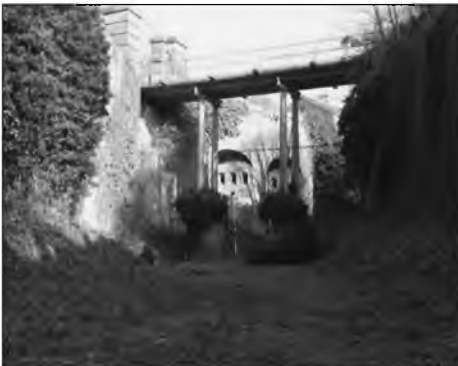
Fort Burgoyne Bridge