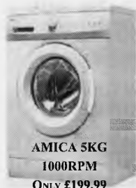
AMICA 5KG 1000RPM ONLY £199.99

REPAIRS TO VACUUM CLEANERS, MICROWAVES AND TOASTERS IN OUR WORKSHOP