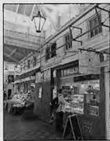
Covered Market Oxford