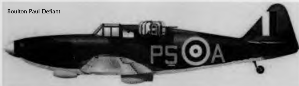
Boulton Paul Defiant

operations and they returned to West Malling. Next day they received seven new replacement aircraft. On 21st July they were posted back to Scotland.