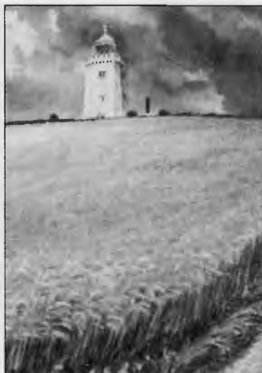
View to South Foreland Lighthouse

liked to paint rocks and mountains of different geological types; she liked to look at shapes of trees and patterns in plants; she loved depicting buildings of all styles, especially the classical architecture of Greece and Rome and the Gothic architecture of France and England. Her subjects were very wide ranging, including buildings in Spain, Italy, Morocco, Russia, Turkey, Greece and America. Locally she was well known for her landscapes of favourite places in Kent. She painted many pictures of Dover Castle and of the surrounding countryside. Her series of 'Doorways in Deal