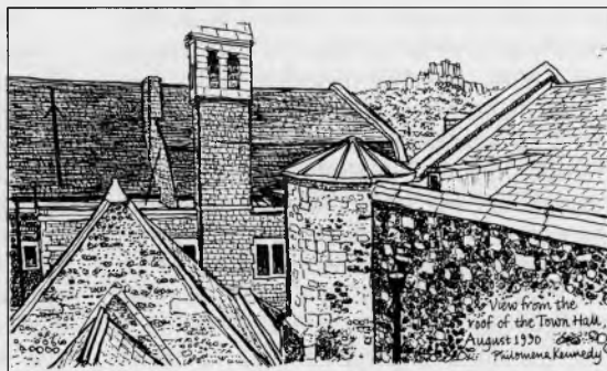
From Newsletter No.10