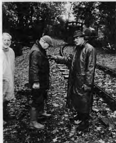
Discussing tactics before starting work