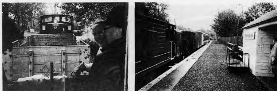
All aboard en route to the work site and the passenger platform on the E.K. Light Railway at Shepherdswell