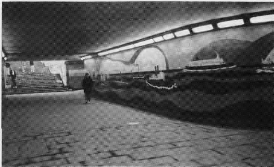
The A20 Underpass – Bench Street to New Bridge

Now that the A20 is finished, it appears to have the approval of most of Dover's residents, with praise for the lay-out, the flower beds and the pedestrian walk-way from Bench Street to the sea-front, which is light and spacious, with firm hand-rails and an attractive mosaic depicting ferries through the ages. Attention now turns to the subject of town centre re-generation and new schemes and plans to persuade people to regard Dover as a tourist centre as well as a port.