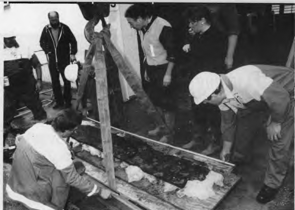
THE FIRST SECTION LIFTED AND TAKEN TO CAMBRIDGE ROAD FOR TEMPORARY STORAGE