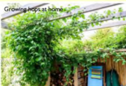
Growing hops at home

Facebook #DealHopFarm email info@dealhopfarm.org.uk