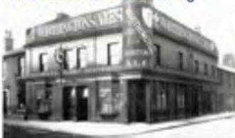
The Golden Lion, Carlisle before the restrictions on advertising.....

To counter this, the government took the drastic step of nationalising public houses and breweries in the immediate area and a newly formed Central Control Board took control of five local breweries and 363 licensed premises covering 300 square miles which included parts of north and west Cumberland, south west Scotland, and the city of Carlisle, 'for the duration of the war and 12 months thereafter'. The scheme became known as 'The Carlisle Experiment'. The Board acted quickly and by 1917 it had closed nearly 40% of public houses in the area they controlled. All off-sales licenses were also revoked. All advertising referring to alcohol was illegal and a ban was placed on the display of liquor bottles in windows. Within the state-owned public houses strict opening hours were enforced. The pub landlords became government employees on a fixed salary and were offered no inducement to increase alcohol sales (in fact it was the opposite, with commissions given for the sales of non-alcoholic drinks and food only). The sale of food was actively encouraged and 'snug' bars were re-purposed as eating areas. Pubs were made to be attractive to women