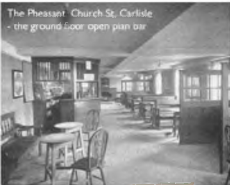
The Pheasant, Church St, Carlisle - the ground floor open plan bar