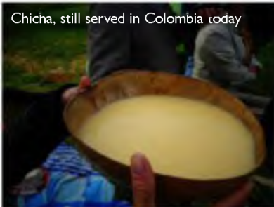
Chicha, still served in Colombia today

It seems likely that it was brewed, and consumed, at gatherings in administrative centres – a combination of beer festival and political meeting. The Wari state was composed of a variety of disparate groups, and Ryan Williams of the Field Museum in Chicago sees such meetings as enabling subject peoples to reaffirm loyalties and offer tribute, with the brewing and serving of beer providing a communal activity that helped to maintain unity among the populations. “In short beer helped keep the empire together.”