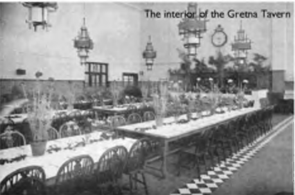
The interior of the Gretna Tavern